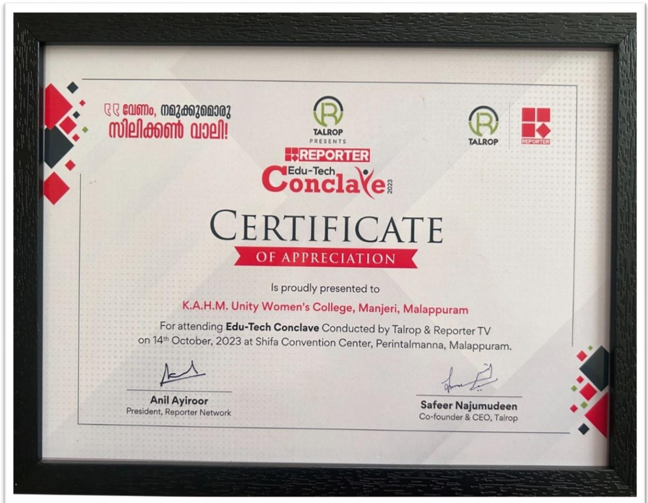
Figure 3- Certificate of appreciation for attending Edu-Tech Conclave

A certificate of appreciation was given to KAHM Unity womens college, Manjeri for attending Edu-Tech Conclave by Talrop & Reporter TV.