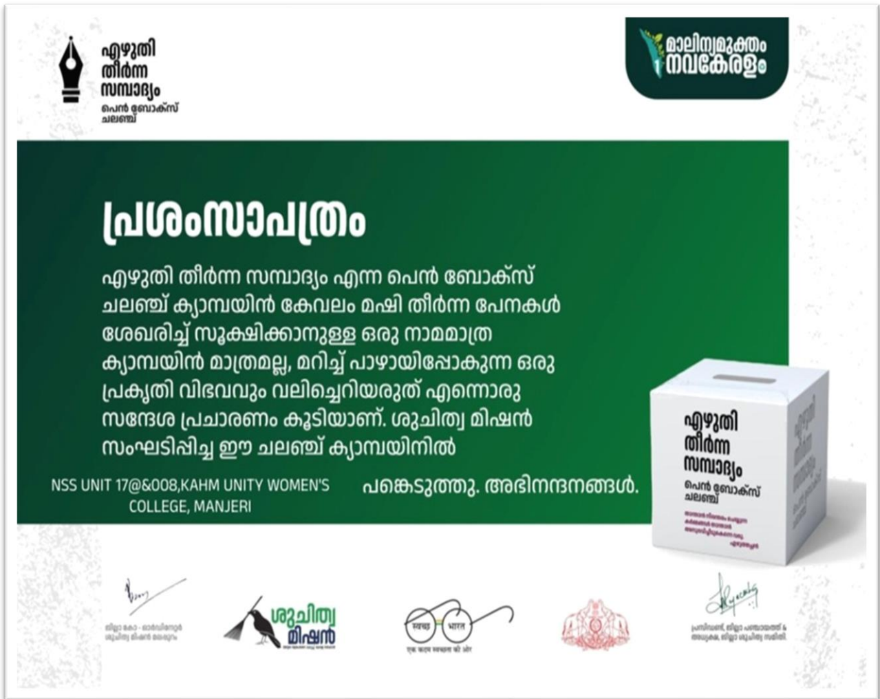
Figure 2- Certificate of appreciation for the collection of used pens

A certificate of appreciation was given to KAHM Unity women's college, Manjeri for collecting the used pens for reducing the pollution through it.