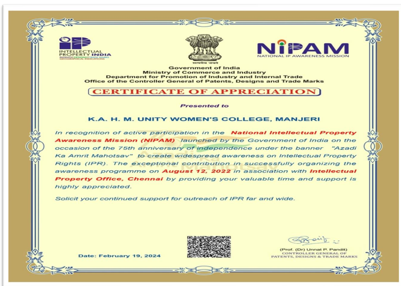
Figure 1-certificate of appreciation from NIPM

A certificate of appreciation presented to KAHM Unity women's college, Manjeri in recognition of active participation in the National intellectual property awareness mission by Government India, Ministry of Commerce and Industry, Department of Promotion of Industry and Internal Trade and Office of the Controller General of patents, designs and trade mark.