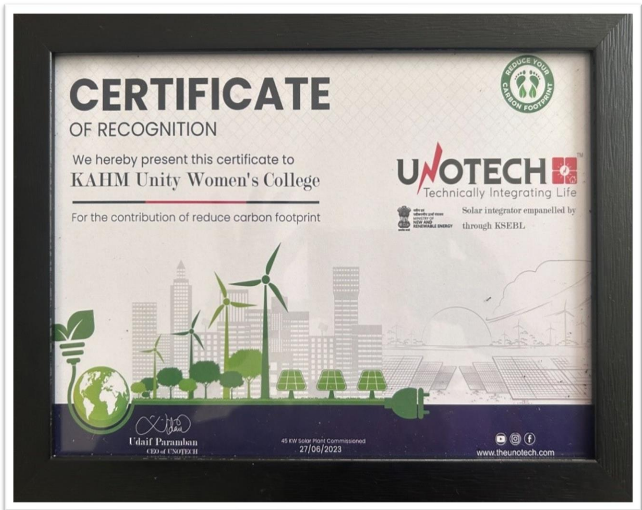
Figure 5-certificate of recognition from Unotech Technically Integrated Life

A certificate of recognition was presented to KAHM Unity women's college for the contribution of reduce carbon footprint from Unotech Technically Integrated Life.