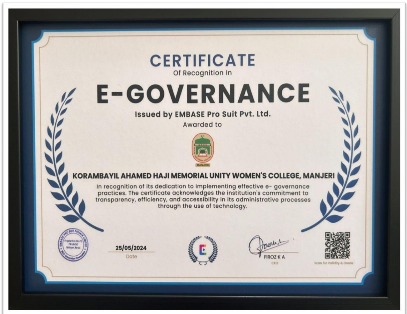
Figure 4- certificate of recognition in E-GOVERNNACE

A certificate of recognition in E-GOVERNNACE for its dedication to implementing effective e-governance practices issued by EMBASE Pro suit pvt.ltd.